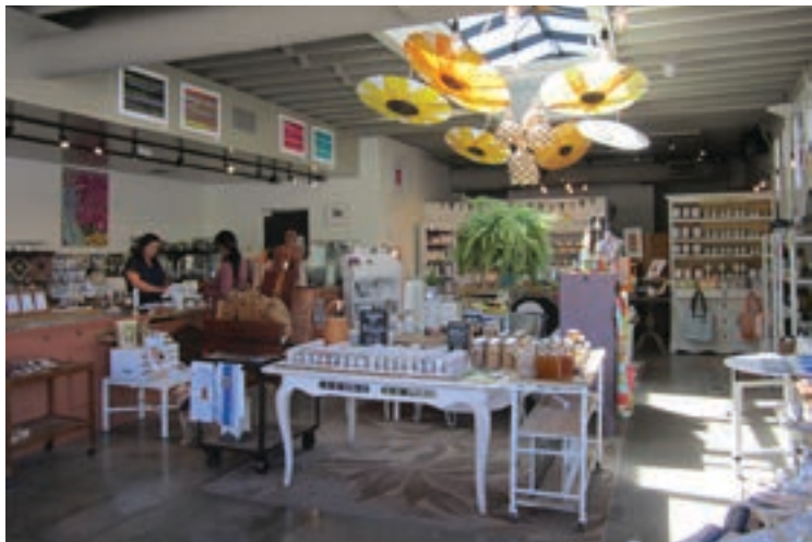
Hollie's Homegrown offers a wide variety of Lamorinda-made items.